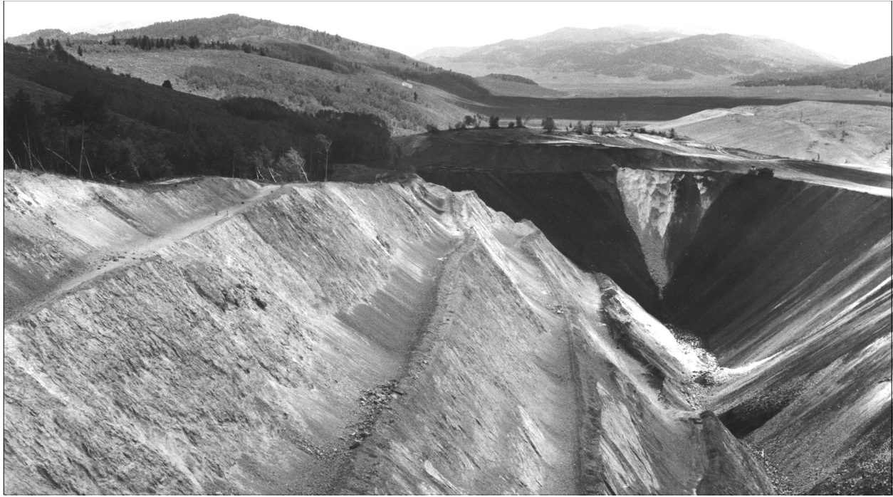
Figure 191. South end of the Enoch Valley Mine, June 26, 1996.