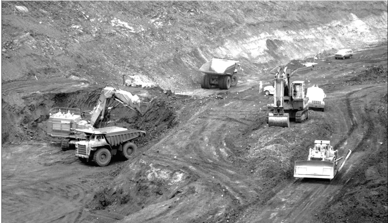
Figure 189. Enoch Valley Mine, May 4, 1995.

the overburden near the south end of lease I-015122 began in mid-September, 1989. The plan for mining the Enoch Valley phosphate reserves called for mining to progress from both ends towards the center of the deposit. The initial pit mining began on October 10, 1989 and was done by truck/shovel methods, operated by Dravo-Soda Springs, a mining contractor (Figures 189 and 190). The primary moving equipment included 85-ton Caterpillar Model 777 haultrucks, Hitachi Model 801 shovel, Caterpillar Model 651 and 656 scrapers and Caterpillar D-9L and D-10N dozers and miscellaneous other equipment such as smaller dozers and motor patrols. By the end of 1989, some ore was stockpiled and the budgeted levels of waste removal were reached.