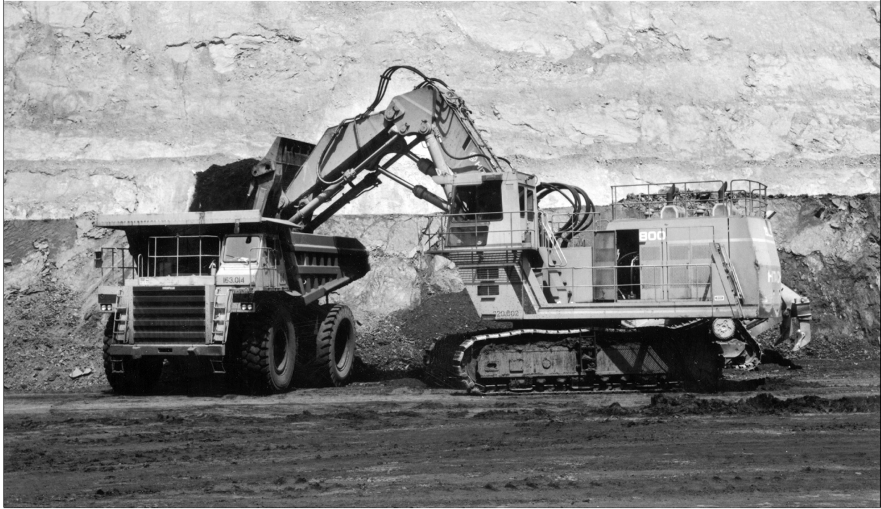
Figure 190. Truck-shovel operations, Enoch Valley Mine, August, 1997.

Company. Monsanto's first production from Federal lease I-011683 occurred in August 1990 (Figure 191). By July, 1992, the phosphate ore reserves on this lease were mined out. In May, 1992, Monsanto started mining on Federal lease I-015033, and by October, 1993, the phosphate reserves were mined out. As of this writing, mining continues on Federal lease I-015122 and State of Idaho lease E-07957 (Figure 192).