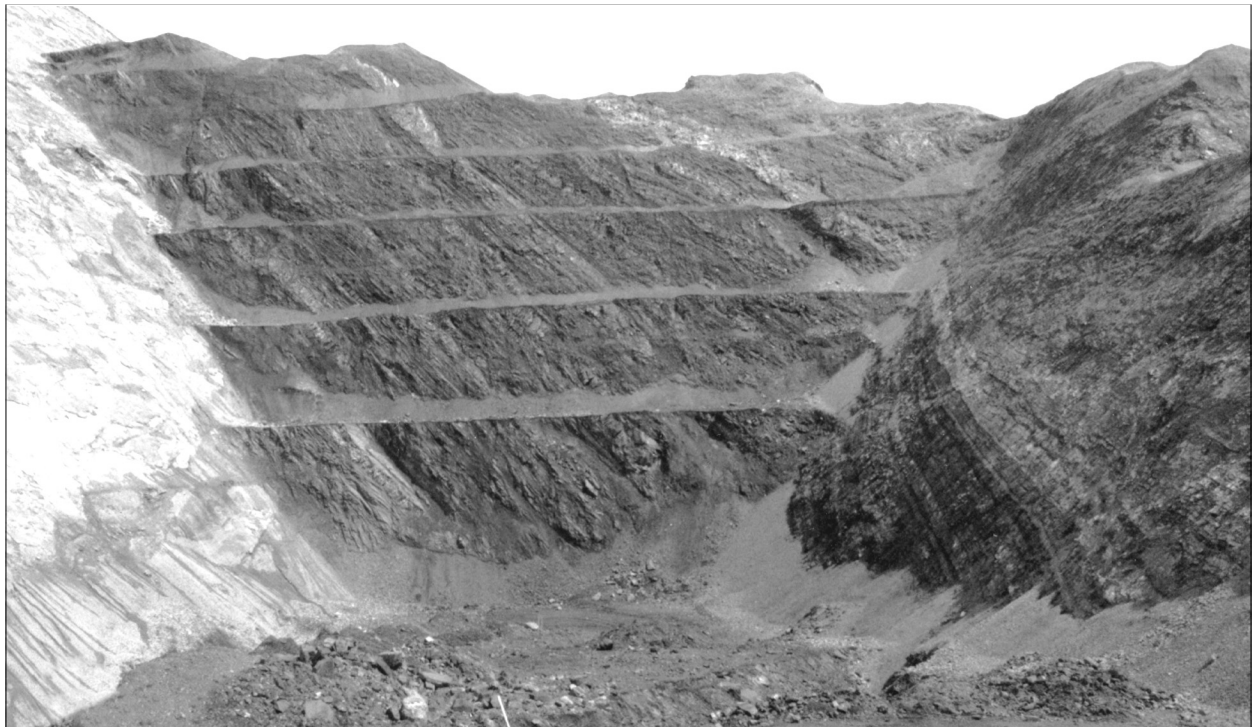
Figure 192. Monsanto's State lease, Enoch Valley Mine, May 4, 1995.